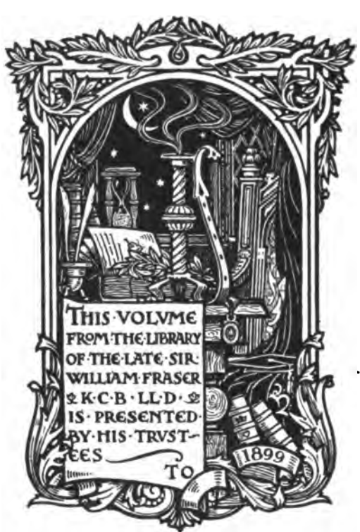
THE · S · S · C · LIBRARY · EDINBVRGH